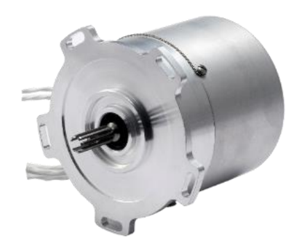
4 channel Cluster