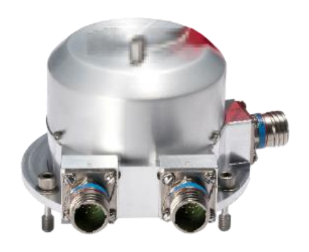
3 channel Cluster